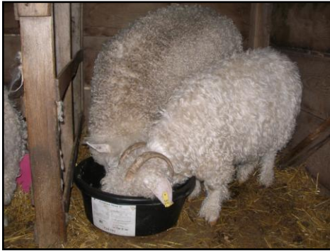
Snowball and Sarah share a meal. Snow is a gentleman ram and Sarah is a lady angora goat. They always eat together.

Only 32 more days until Spring!!!!!!!!!!!!!!!!!!!!!!!!!!!!!! Yeah!!!!!!!!!!!!!!!!!!!!!!!!!!!!!!